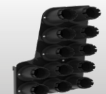
Die Storage Panel EVO